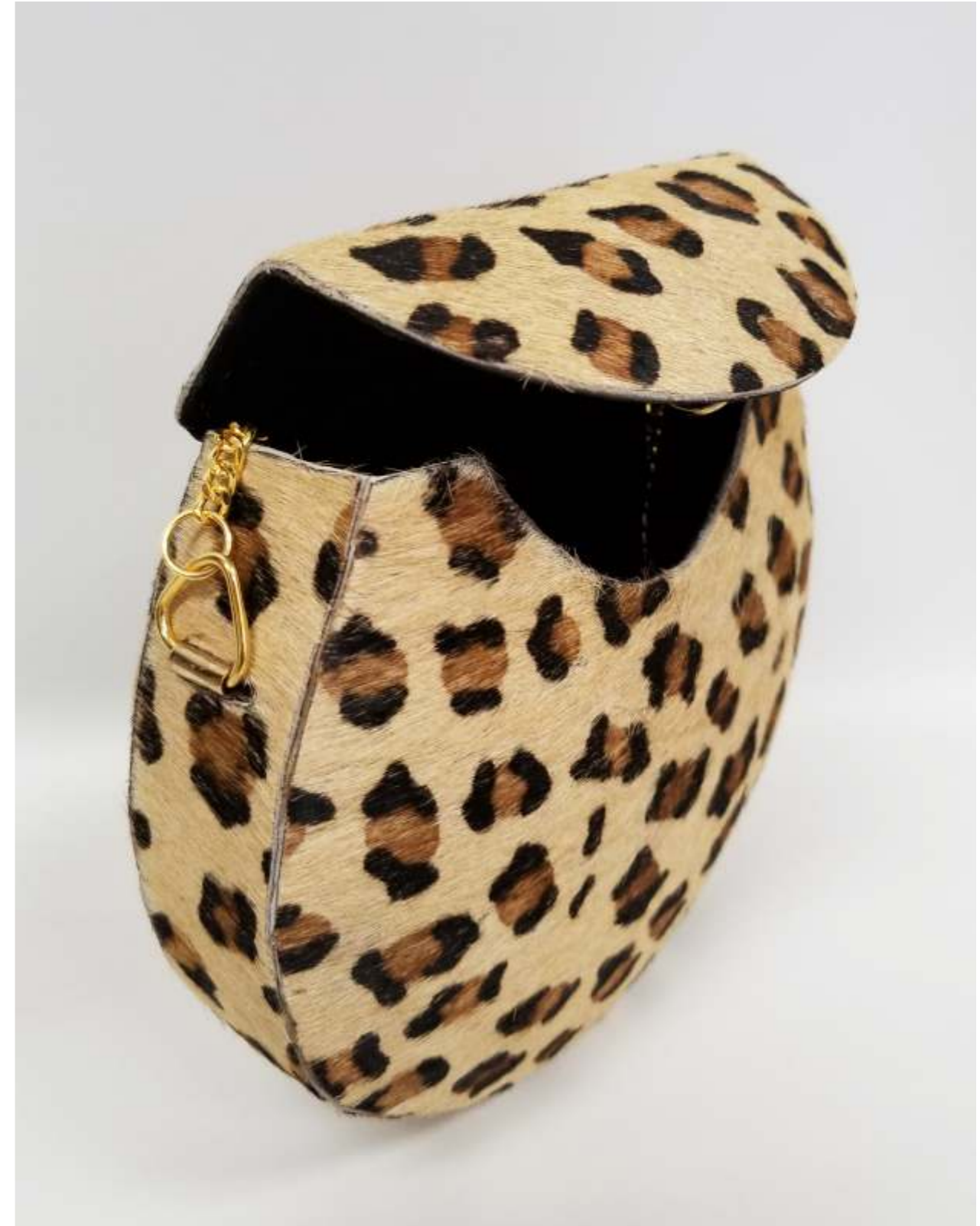
RD SB 033 L HAIR ON GENUINE WITH GOLD FOIL LEATHER BELT $ 29