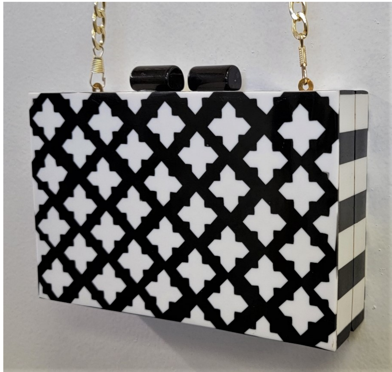
ROYAL BOX BAG INLAY/CROSSBODY CHAIN STRAP $ 42.00