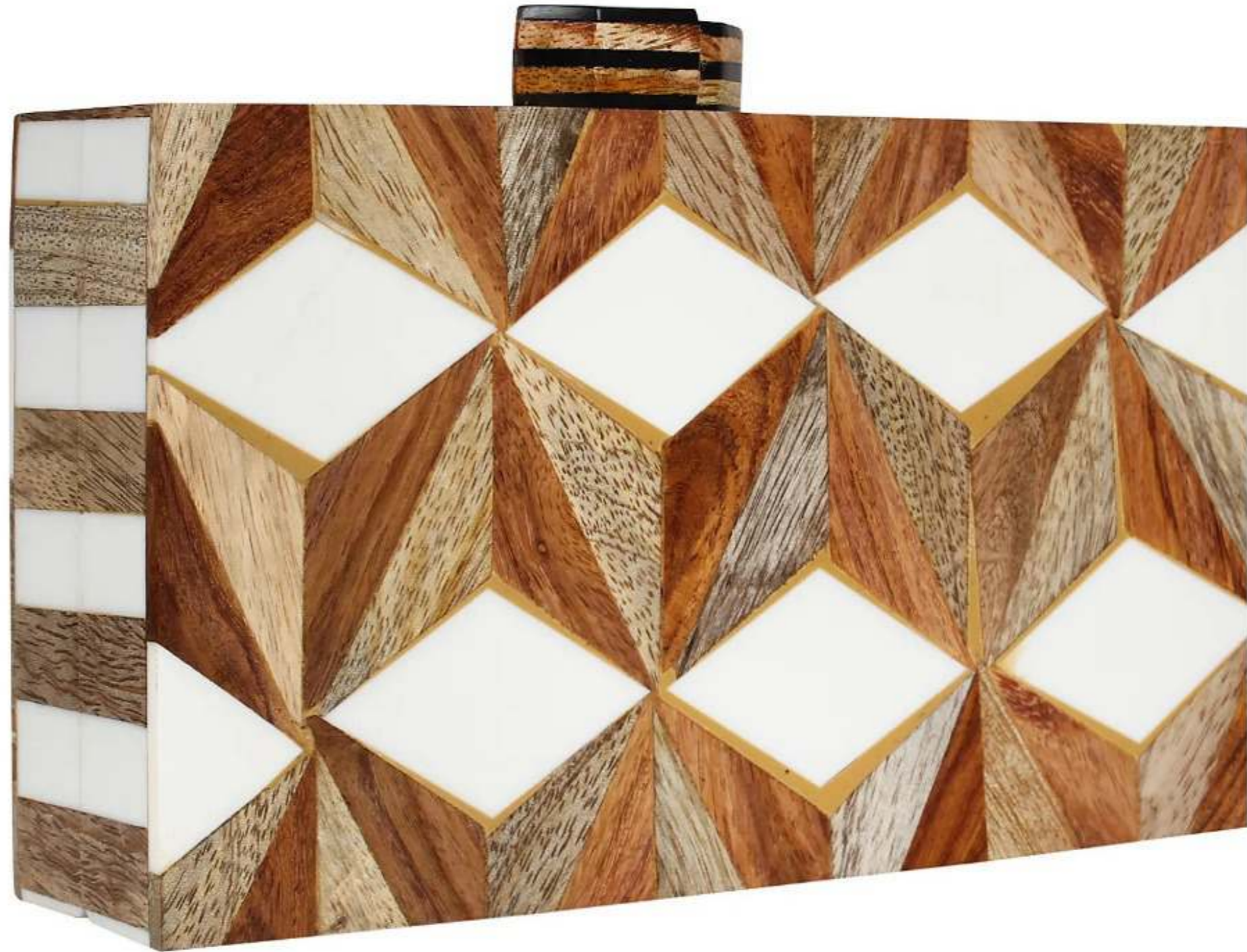
CMI WOOD CUBE BOX AND CHAIN STRAP $44