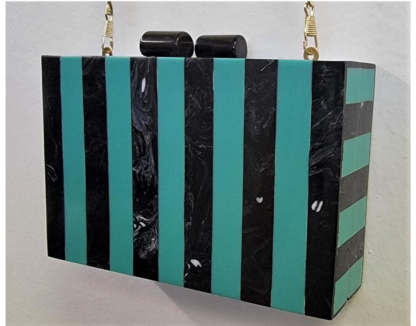
AQUA FALL INLAY STRIPE BOX BAG