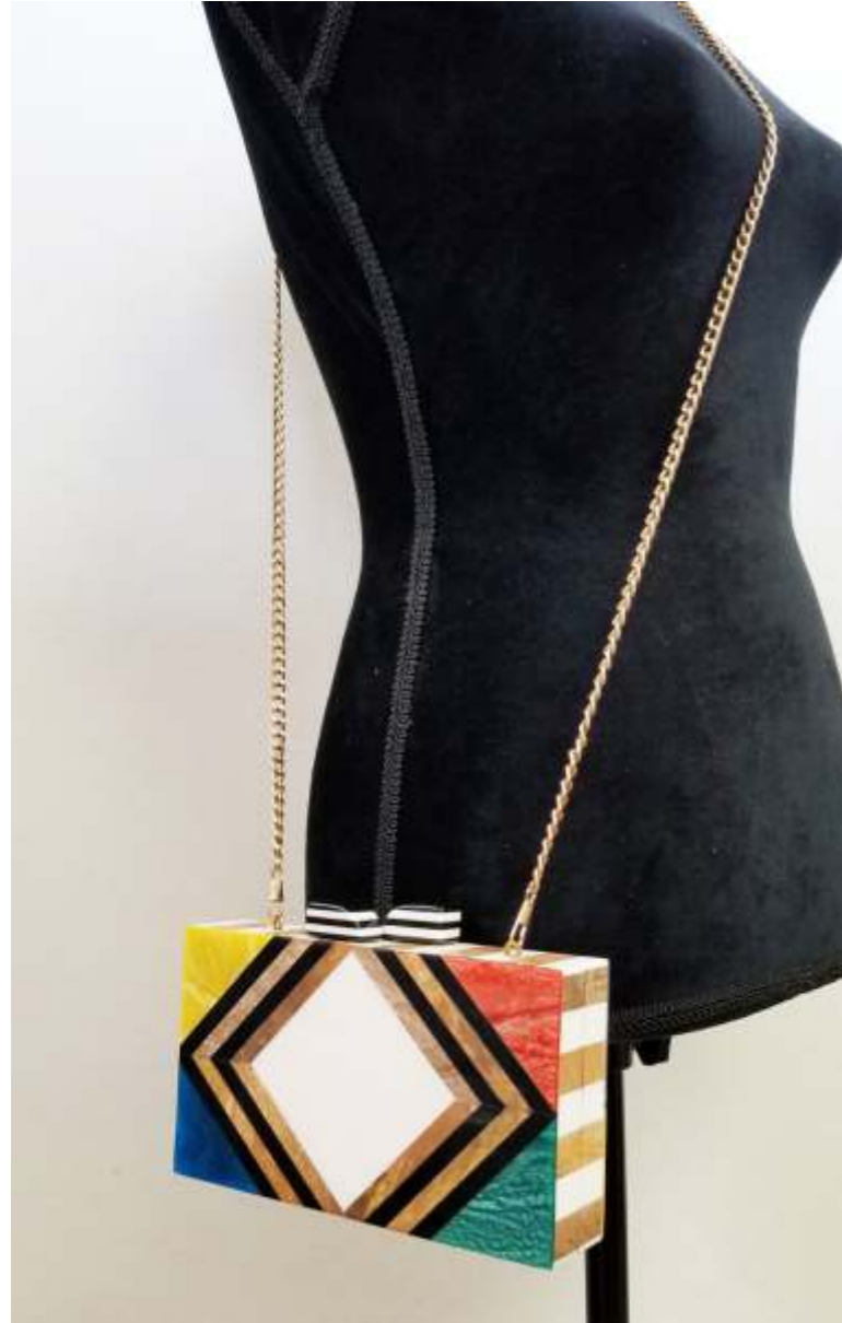
CMI BG 2140 WOOD BOX WITH INLAY ACRYLIC WORK AND CHAIN STRAP $42