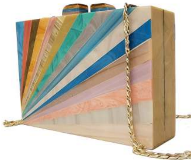
RAYS WOOD AND RESIN INLAY CLUTCH WITH CHAIN STRAP $ 42