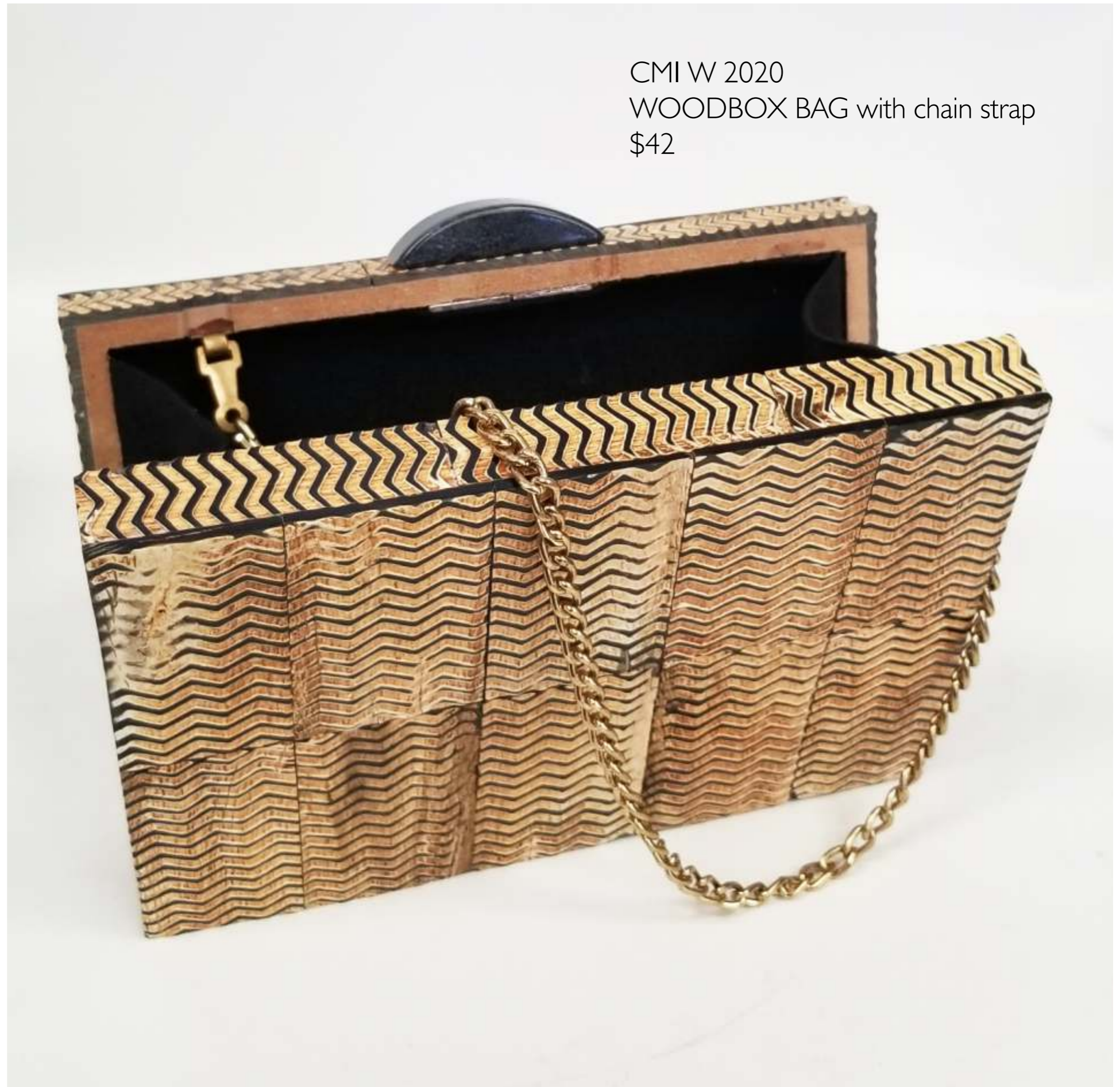
CMI W 2020 WOODBBOX BAG with chain strap $42