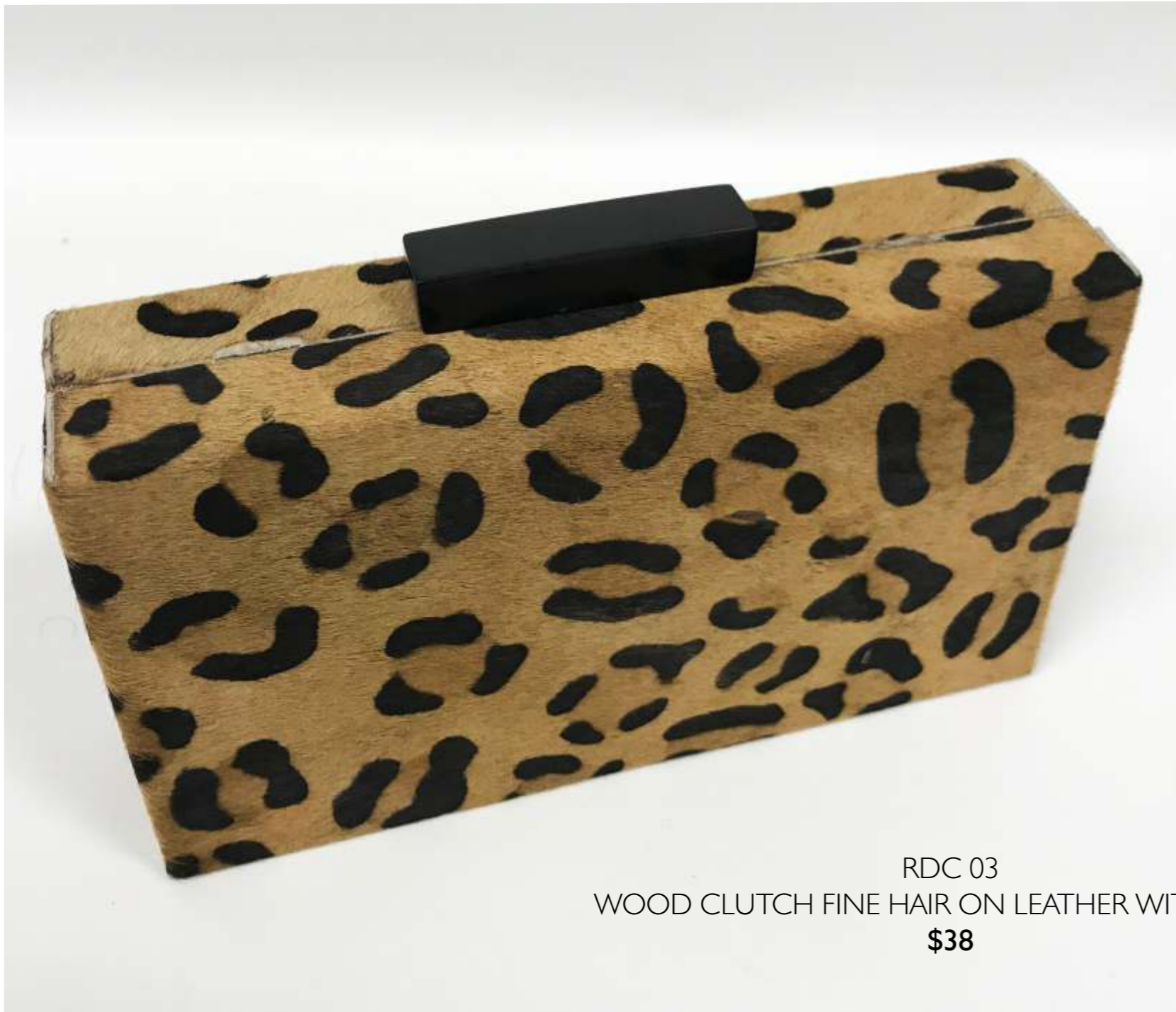
RDC 03 WOOD CLUTCH FINE HAIR ON LEATHER WITH CHAIN $38