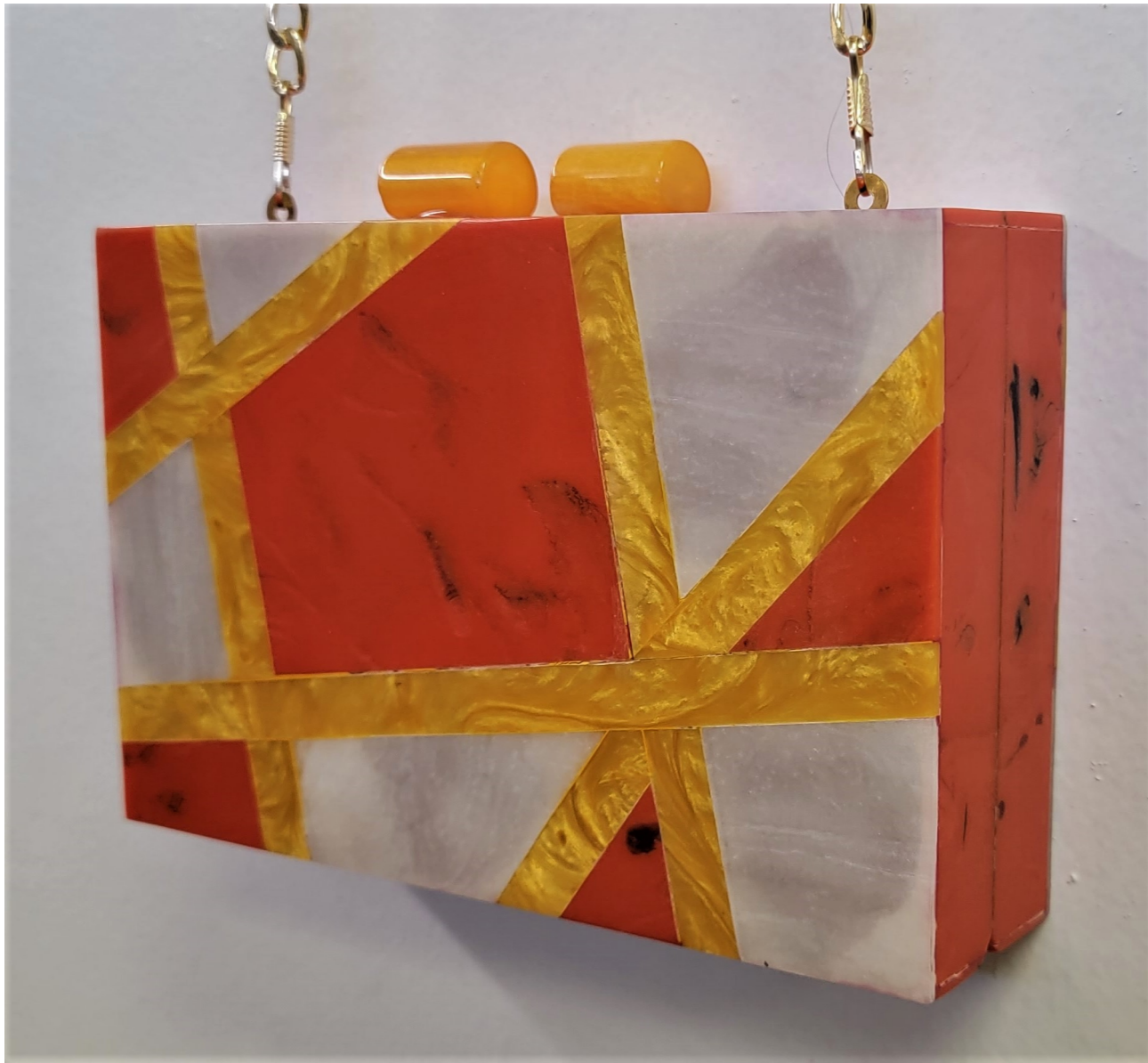
GOLD FLAME BOX BAG WOOD AND ACRYLIC $ 42.00