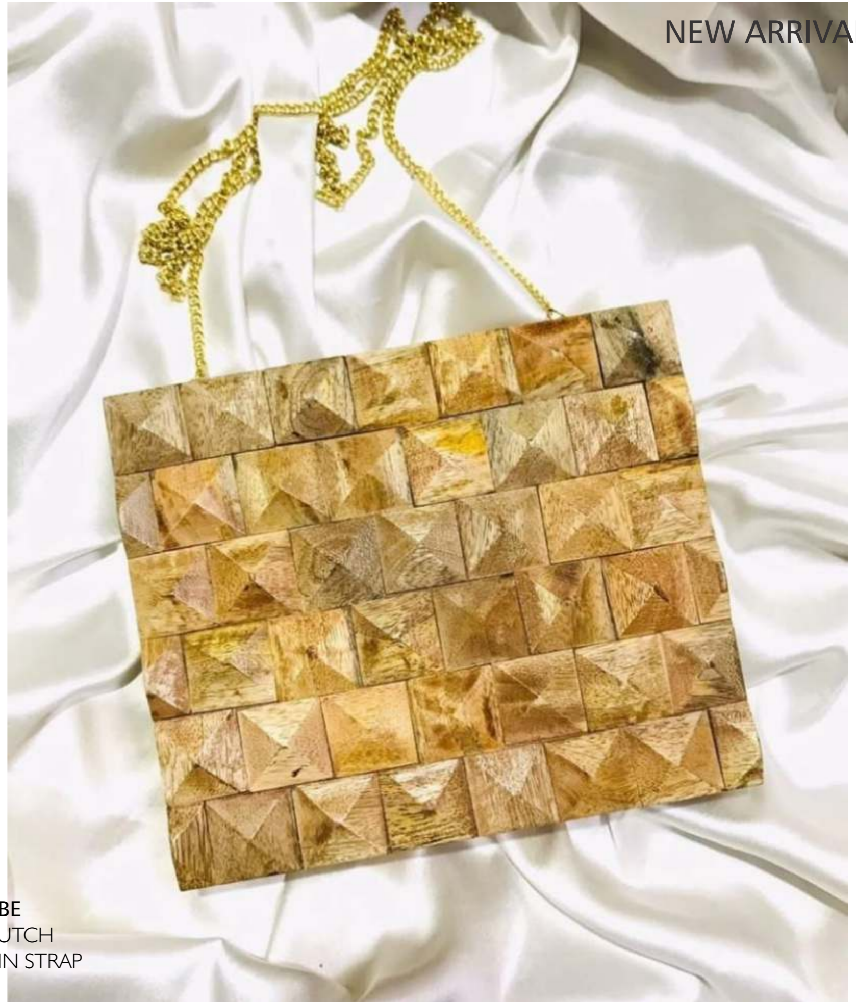
WOOD CUBE WOOD CLUTCH WITH CHAIN STRAP $ 44