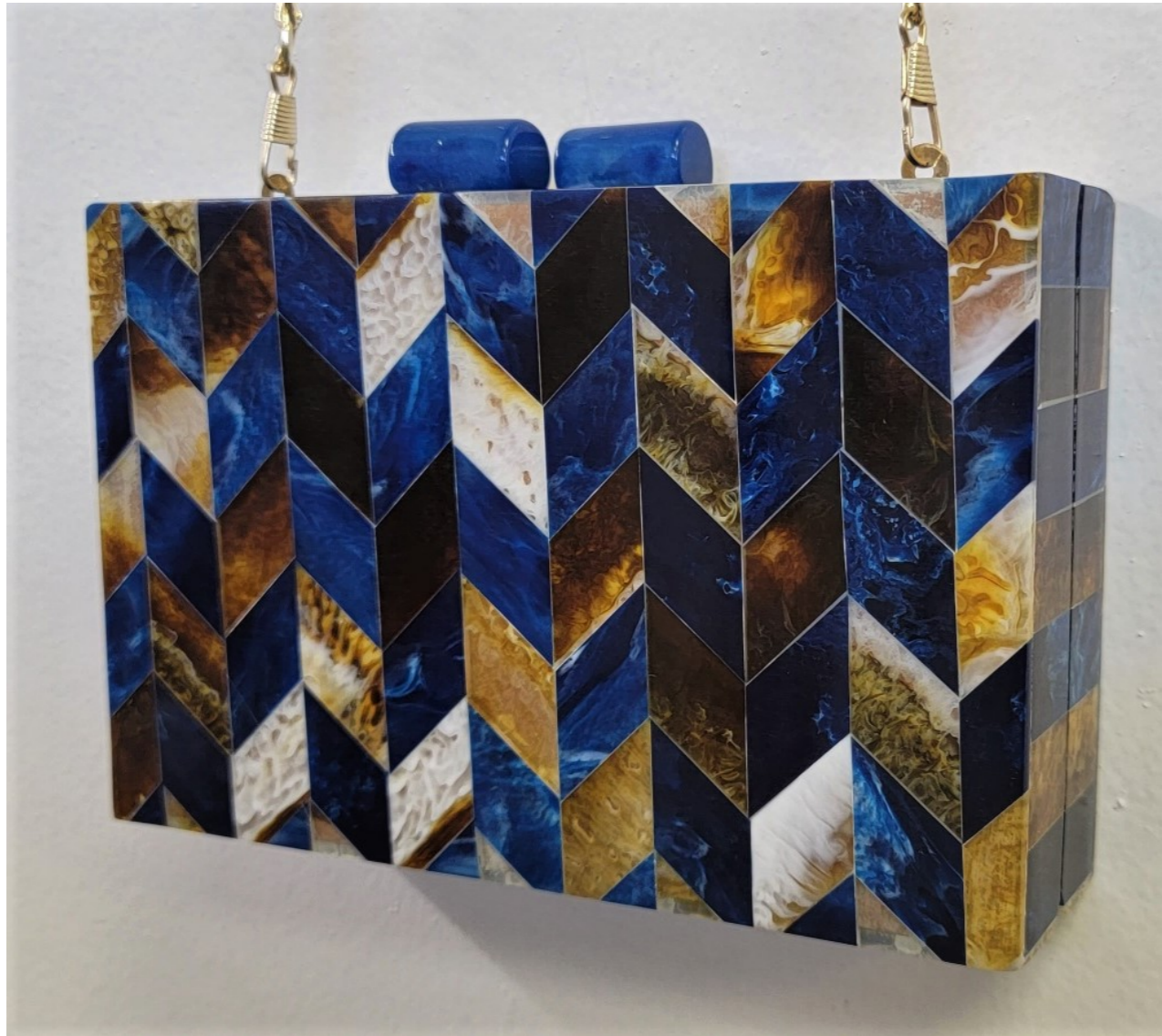
BLUE DIAMOND INLAY BOX BAG