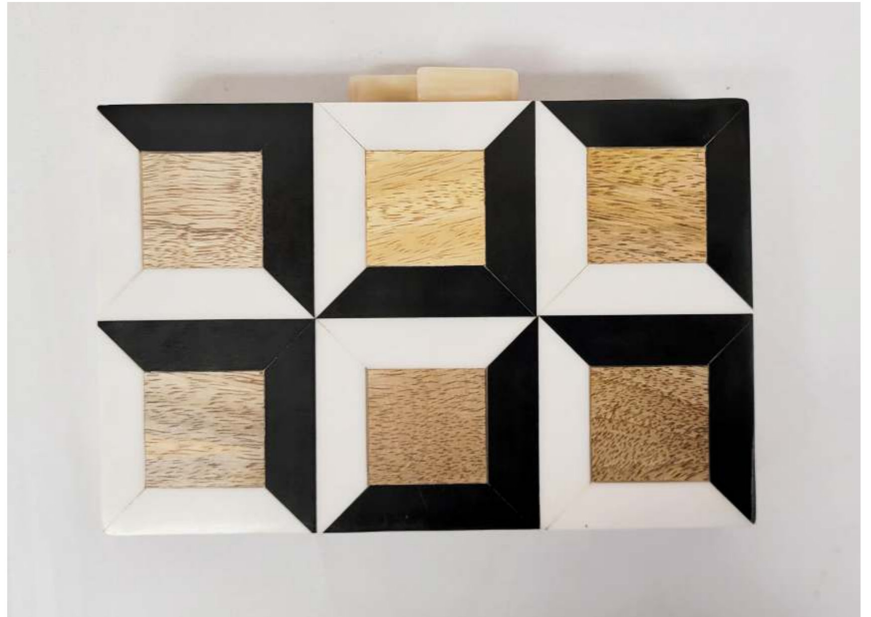
WOOD MAGIC WOOD AND RESIN INLAY CLUTCH WITH CHAIN STRAP $ 44