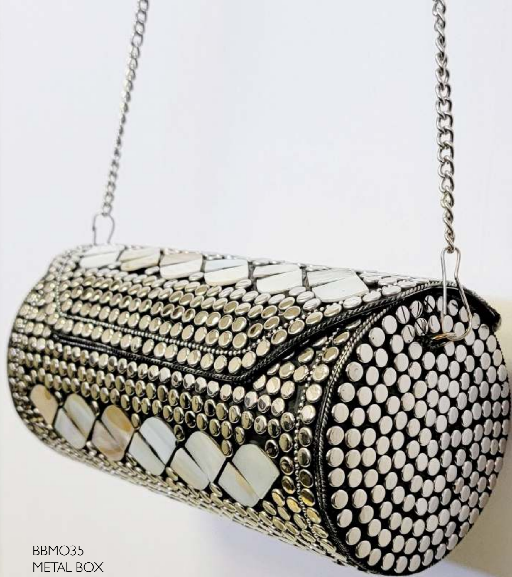
BBMO35 METAL BOX AND CHAIN STRAP $38