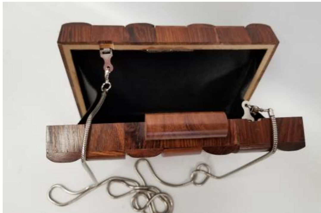
CMI W 2144 WOOD BOX AND CHAIN STRAP $44