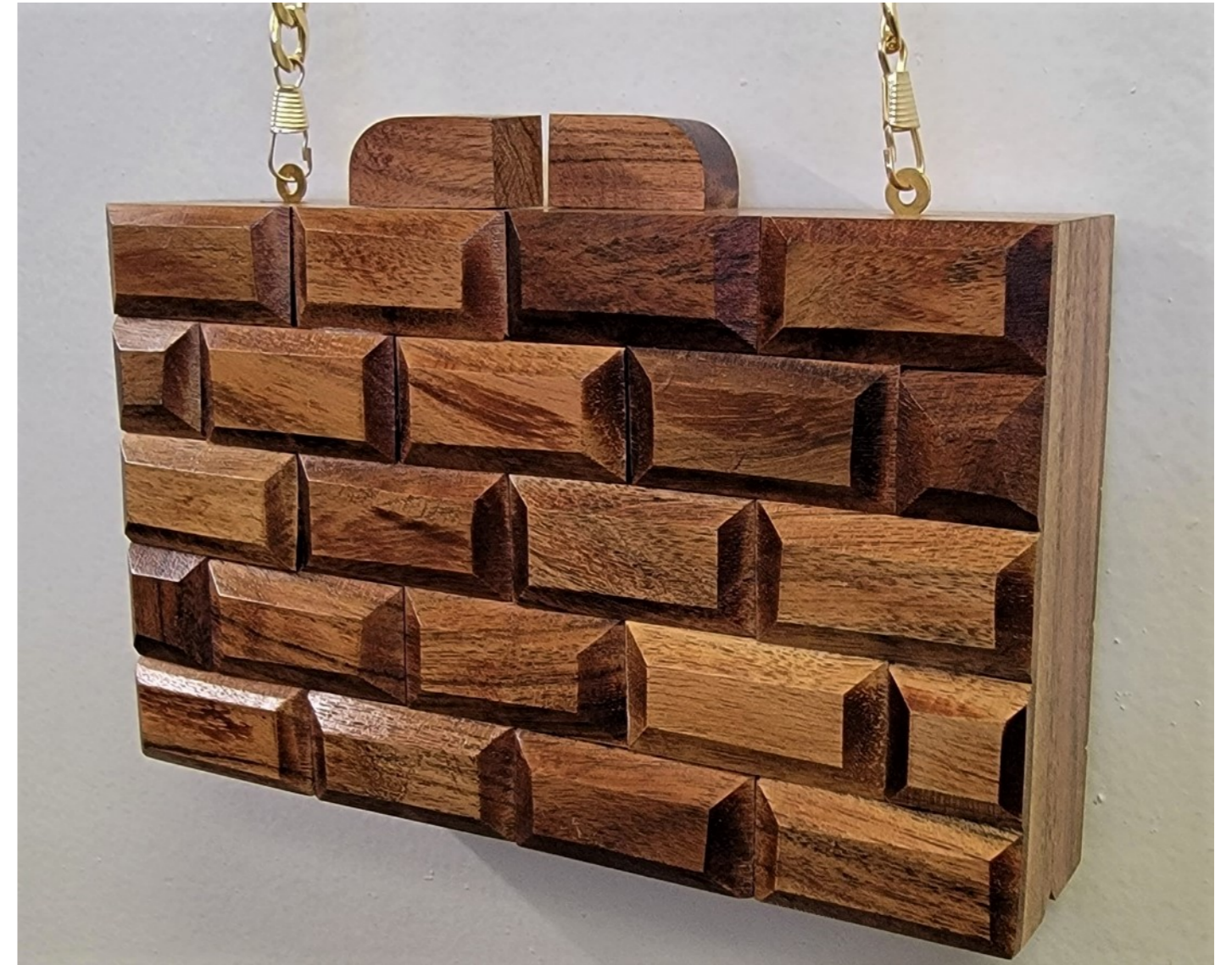
BRICKS NATURAL WOOD BOX BAG $44.00