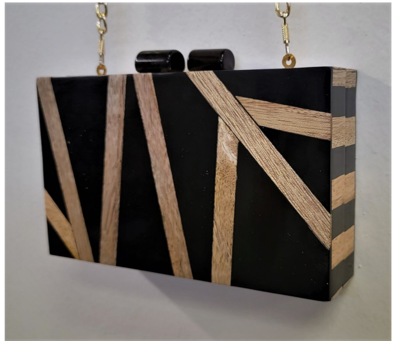
FOREST BOX BAG WOOD AND ACRYLIC INLAY CROSSBODY CHAIN STRAP $ 44.00