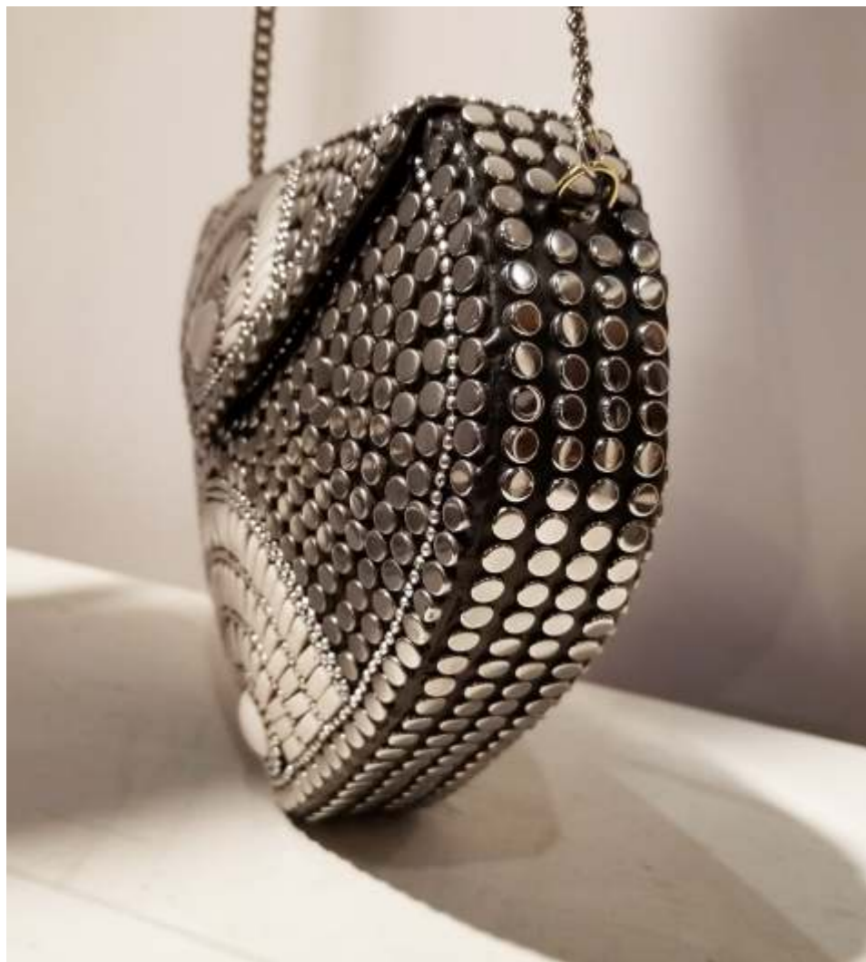
CMI WHITE HEART METAL BOX BAG MULTI $29