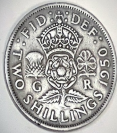
King George English Shilling

King George Shilling has the classic British Tudor Rose surmounted by the Royal Crown, with thistle and shamrock representing Scotland and Ireland.