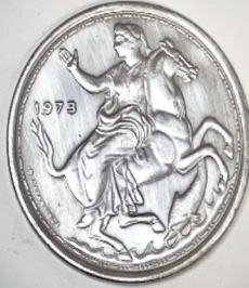
Athena Greek Drachma

Athena Greek Drachma shows the Goddess Athena riding a horse across the waves as a dolphin passes. the horse and Dolphin represent the God Poseidon, the lover of Athena,