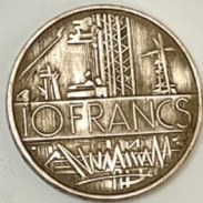
Deco French Franc

Deco French Franc celebrating the age of industry and man's building the future.