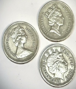
Queen Elizabeth II Pence

Queen Elizabeth II Pence featuring three iconic images of the Monarch spanning her reign, the longest in British history.