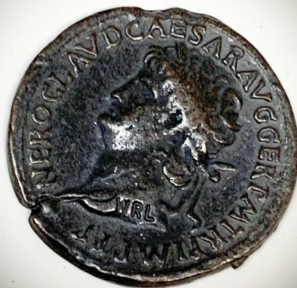
Hand cast Roman Coin

The Hand Cast Roman Coin is one of a few reproductions that we use and has its own special story. Found in Great Britain on a family farm, it was from the period England was ruled by Rome. These coins are hand cast and finished by the same family that found it.