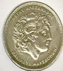
Alexander the Great Greek Drachma

Alexander the great Greek Drachma features a classical image of possibly the most famous Greek conquerors, Alexander, known for creating the largest empires of the ancient world.