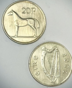
Irish Thoroughbred Pence

Irish thoroughbred pence embodying the two classic depictions of Ireland, the racing thoroughbred and harp.