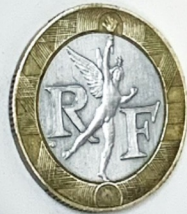
Winged Victory French Franc

Winged Victory Deco French Franc celebrating the age of industry and man's building the future. This French Franc has a central medallion with Vicci, the winged God of Victory surrounded by Golden Art Deco border.